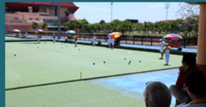
2011 BORNEO LAWN BOWLS CUP