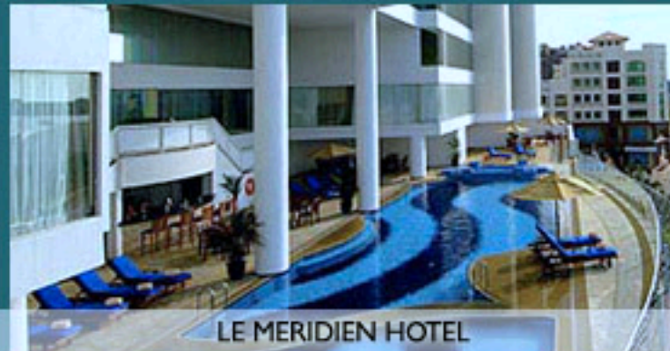
LE MERIDIEN HOTEL