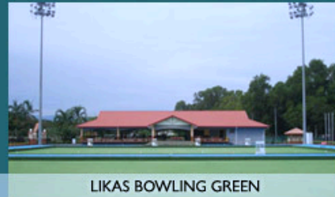
LIKAS BOWLING GREEN